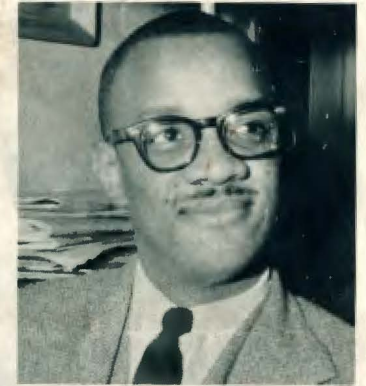
Dr. Ralph Abernathy

Vice President at Large, Southern Christian Leader- ship Conference